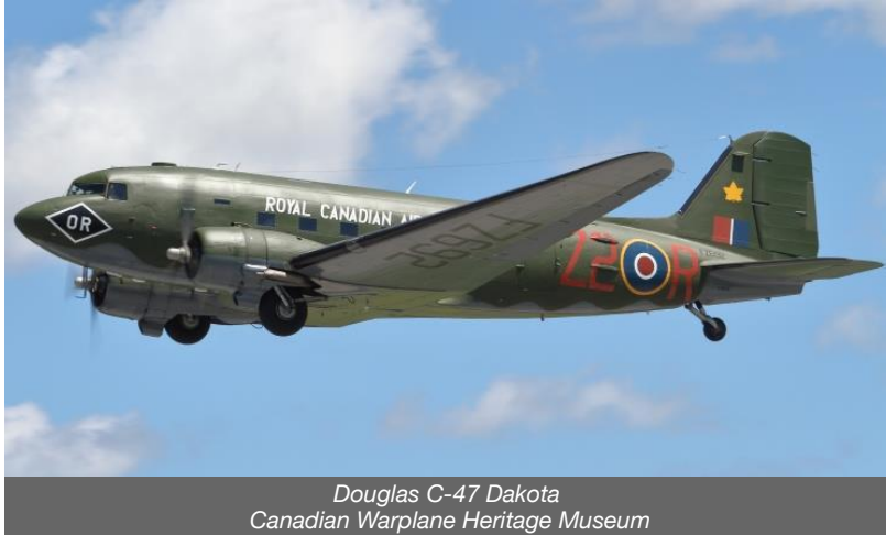
Douglas C-47 Dakota Canadian Warplane Heritage Museum

Development of the Douglas DC-3 started in early 1935 with the prototype flying by the end of the year. The first production aircraft was delivered to American Airlines in July 1936 and soon orders were pouring in from US and overseas airlines. The US Air Corps became interested in the DC-3 and ordered a military version, called the C-47 or Dakota. It had many capabilities, including dropping paratroops and supplies, evacuating the wounded, troop transportation and glider towing. Eventually, about 10,000 C-47s were built for the US military.